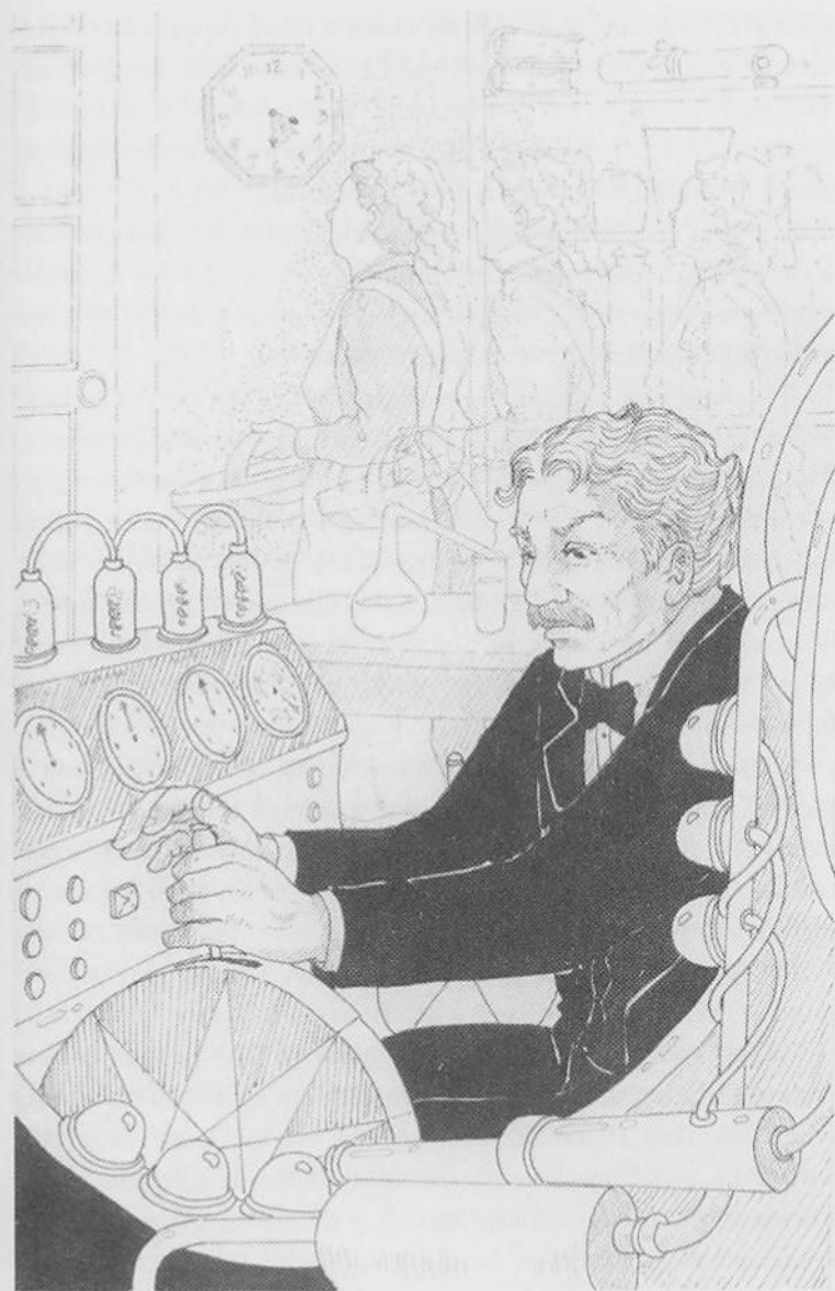
The laboratory grew faint and unclear.

'As my speed increased, night followed day faster and faster. The faint picture of the laboratory seemed soon to move away from me. I saw the sun jumping quickly across the sky,